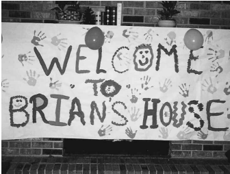
Brian's House getting new and improved kitchen

The eight young men who live at Brian's House, Wings of Hope and CHS are blessed that Reza chose to make such a big difference.