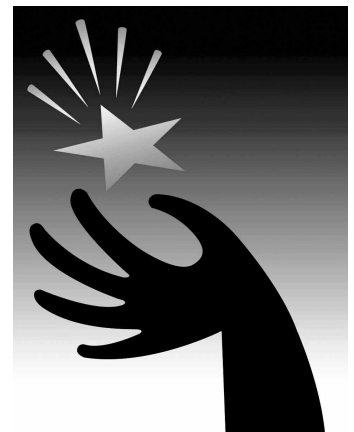
Joseph's light shines on!