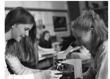
Your support makes a difference

That's a total of $57,355 so far. Our next report will cover April 2012 though June 2012.