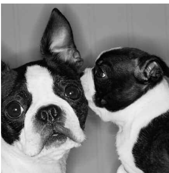
Spread the word